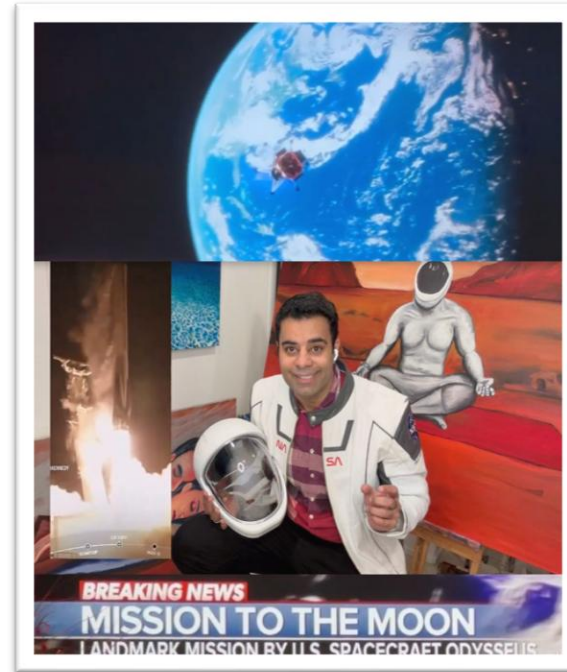
National Media Coverage of Moon Mission